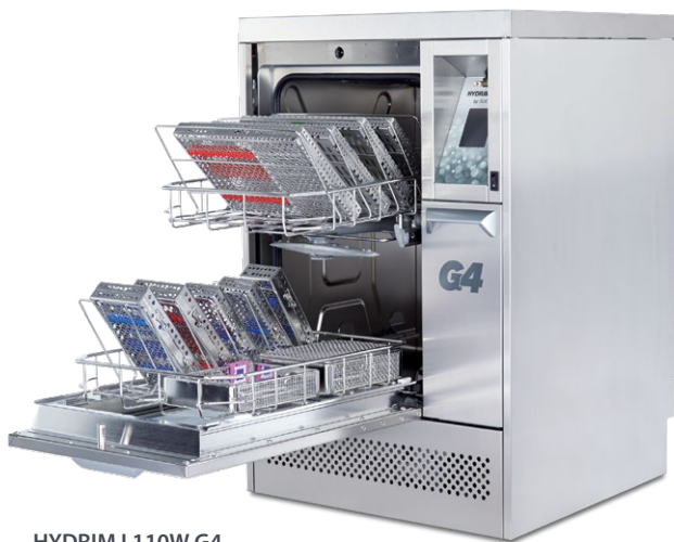
HYDRIM L110W G4 also available