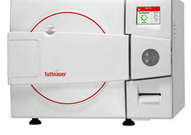
LabSci 11L-PVGC - 28 Liter