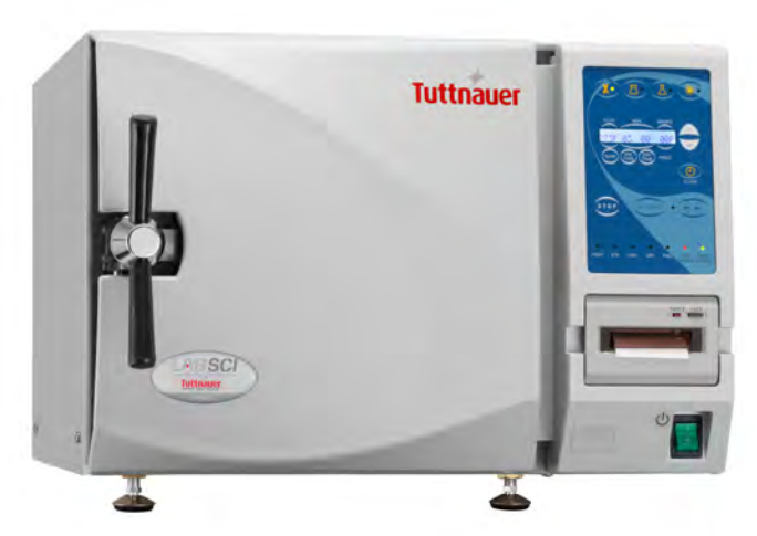
LabSci 9-19 Liter • LabSci 10-23 Liter