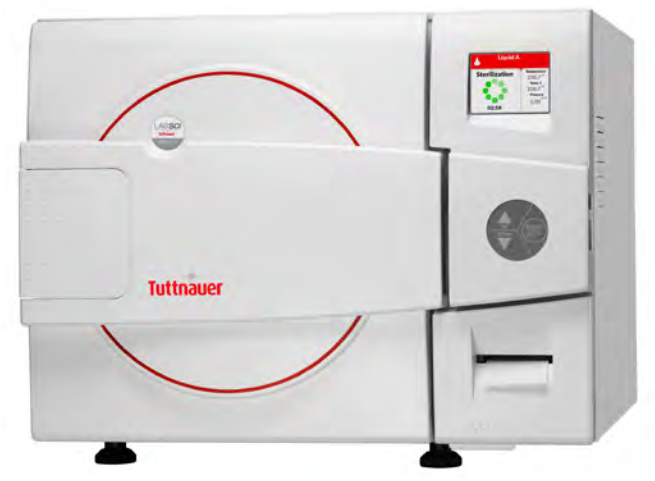
LabSci 11L-28 Liter • LabSci 15L-65 Liter • LabSci-15L+ -85 Liter