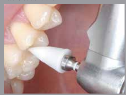
Removes cement or composite flash Removes intrinsic stain