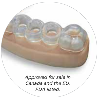
Approved for sale in Canada and the EU. FDA listed.