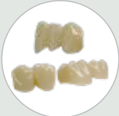
Dentca Crown and Bridge