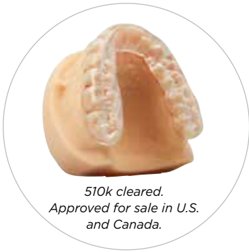
510k cleared. Approved for sale in U.S. and Canada.