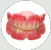
Dentca Denture, Teeth, Base and Try-in

THE SYSTEM IS AVAILABLE FROM WHIP MIX AND VALIDATED BY DENTCA™ AND IS COMPRISED OF THE ASIGA MAX 3D PRINTER, THE UVITRON UV CURING UNIT, AND DENTCA™ 3D PRINTABLE RESINS.