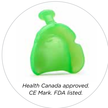
Health Canada approved. CE Mark. FDA listed.